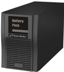
Battery Pack with inside 2x Battery Sets (Each battery set contain 3x 12V/7Ah batteries) Datasheet: Link Item No.: 10120566 Possible to connect more than one BP